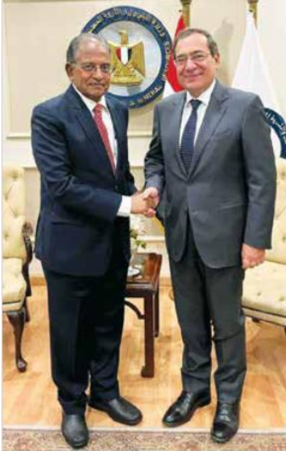
Minister for Petroleum and Mineral Resources, Government of Egypt, H.E. Eng. Tarek El Molla with PS Jayaraman.

TCI Sanmar Chemicals signed a Memorandum of Understanding (MoU) with United Gas Derivatives Company (UGDC), solidifying a strategic partnership that will further bolster TCI Sanmar's commitment to Egypt's petrochemical sector and its national economy.